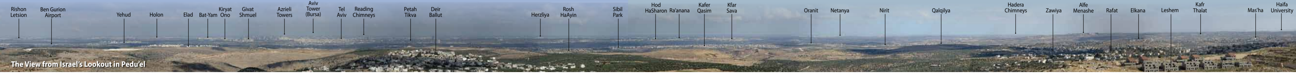
The View from Israel's Lookout in Peduel